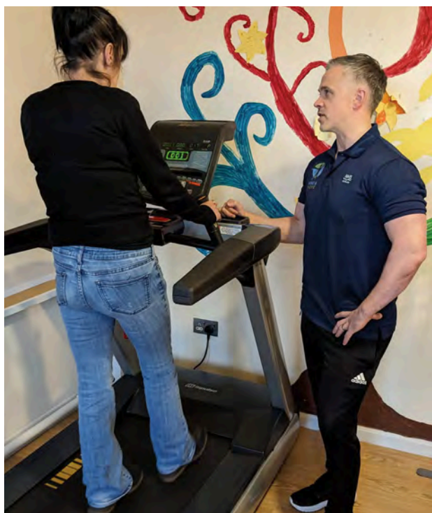
A patient tries the new treadmill at Dunino.