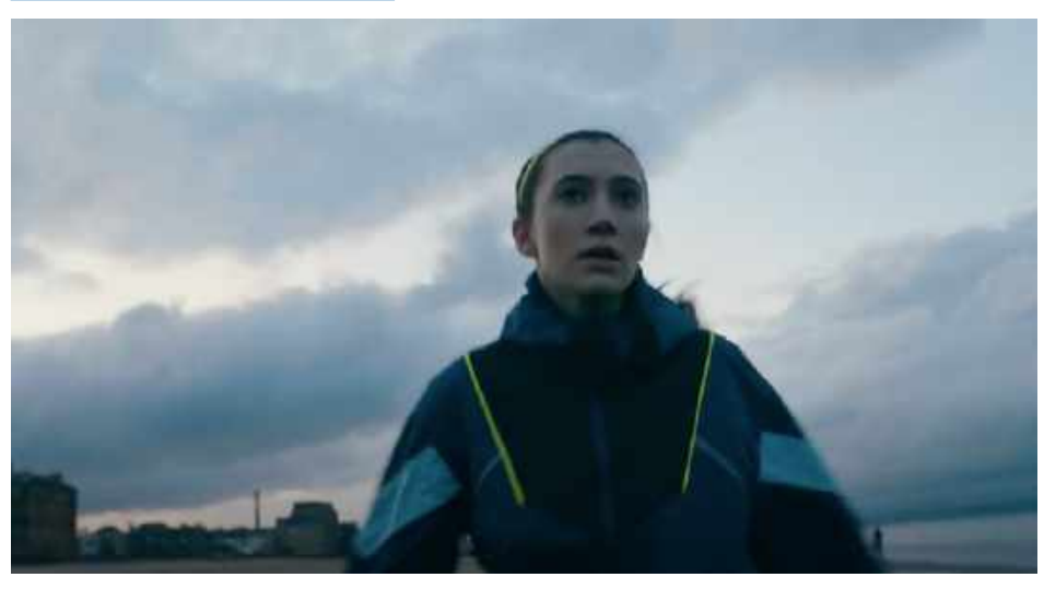
30 second YouTube film