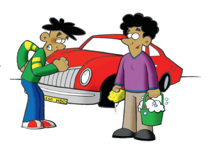
Don't forget to stretch before and after most physical activities to avoid a set-back!

So the first thing not to do is panic, but many people do. It is best to have a set-back plan ready if one occurs.