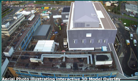
Aerial Photo illustrating interactive 3D Model Overlay