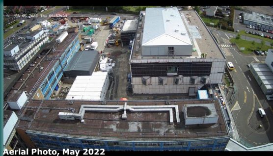
Aerial Photo, May 2022