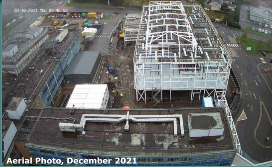
Aerial Photo, December 2021

The online webcam, available through the NHS Fife website, has an interactive 3D model which overlays a model of the new building onto the aerial photo as seen below. This gives you a great idea what the new hospital will look like in the near future.