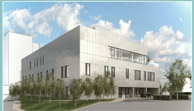
Artistic impression of the completed Elective Care Centre

Public/visitor parking is still available at Car Parks L1 and L2, and new accessible/disabled parking facilities are available adjacent to the A&E entrance.