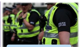
You are not alone.